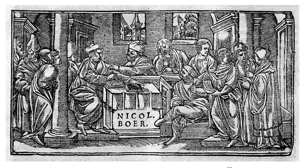
Fig. 1: Nicolas Bohier as judge in the Bordeaux Parlement.<sup>27</sup>

Its structure was ill suited to administrative tasks. Despite its mandate being a broad one, "concerned with everything from the price of firewood or the danger of the plague, to the choice of officers for the militia"<sup>24</sup>, in the case of local municipal business, its performance was really only reserved for the role of intermediary and overseer.<sup>25</sup> Unsurprisingly, the arrival of regional parlements saw an increase in municipal activity in this regard, with their ability to dominate city agencies by their greater dynamism and accompanying superiority, and not necessarily because of explicit authorisation.<sup>26</sup>