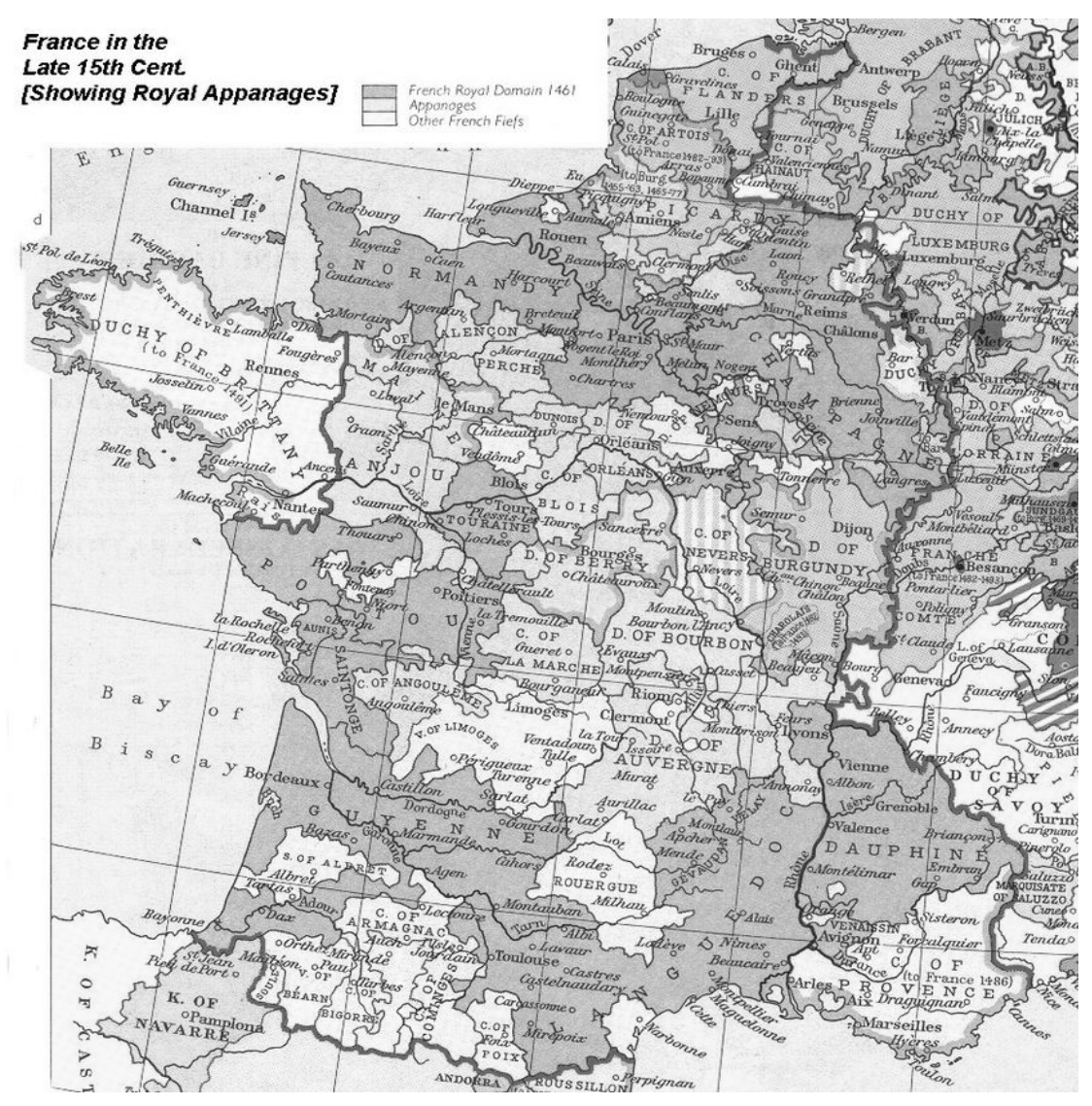
Fig 2: Map of France in the late fifteenth century.<sup>42</sup>

operated in each area.<sup>40</sup> Each regional parlement was born out of its own individual and unique circumstances. The Bordeaux parlement , for example, took over the role of the older Cour superieure of Guyenne.<sup>41</sup>